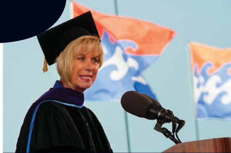
Representative Janice K. Hahn addressing 2012 graduates during her commencement address.

Congresswoman Hahn encouraged the graduates to "do justice for those who cannot defend themselves," adding, "You will find that the 'least of these' are the only ones worth fighting for. Finally, she reminded the graduates of their purpose in life: "People who are in need can take courage in people like you who will serve the world."