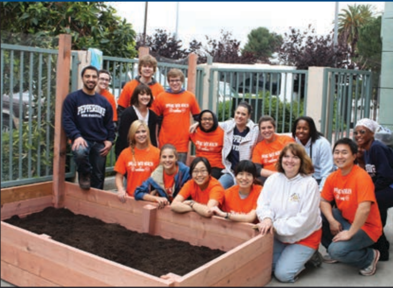
Students, staff, and Pepperdine community volunteers next to a newly built garden bed at the Martin Luther King, Jr. Recreation Center in Los Angeles.