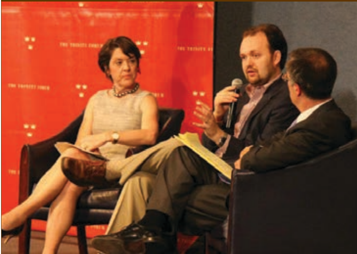
Barbara Bradley Hagerty, Ross Douthat, and Michael Gerson conclude the Evening Conversation.

The School of Public Policy, in partnership with the Trinity Forum, hosted an “Evening Conversation with Ross Douthat,” on April 17, 2012, at the National Press Club in Washington, D.C.