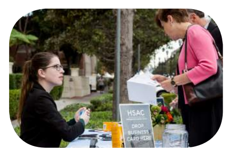
HSAC INTERN PROGRAM

The Los Angeles exercise brought together over 100 staff from various city departments.