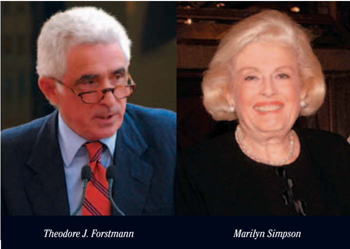
Theodore J. Forstmann