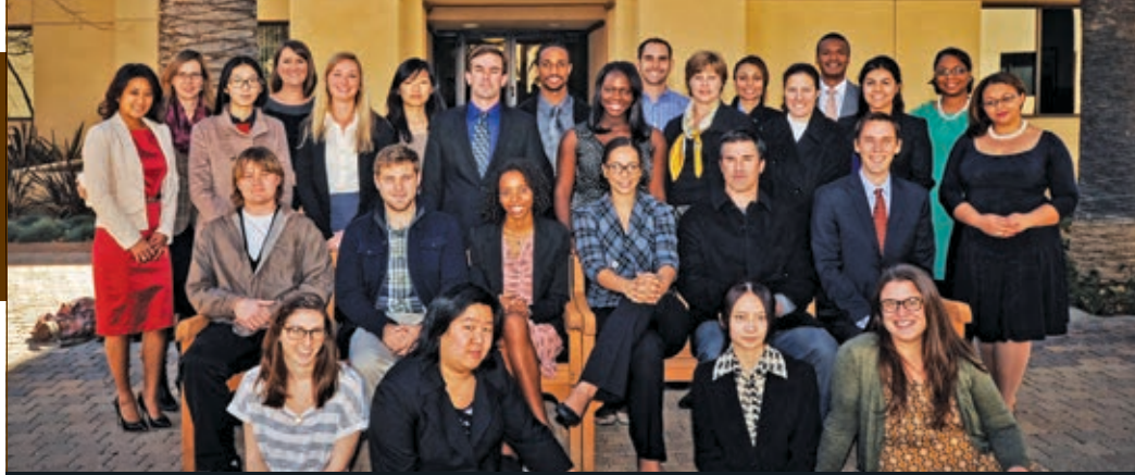
2012-2013 School of Public Policy Scholarship Recipients.