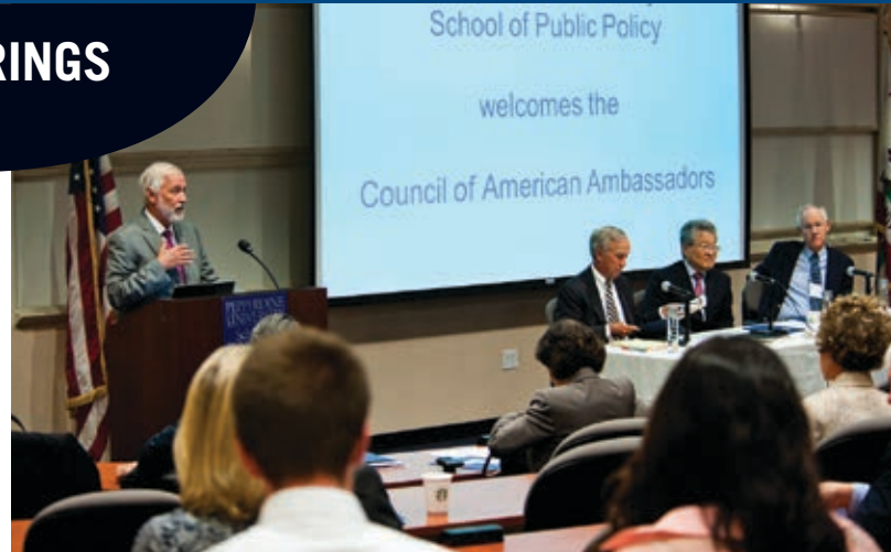
The School of Public Policy hosted more than 50 former U.S. Ambassadors for their annual conference on the Malibu campus in October 2012.