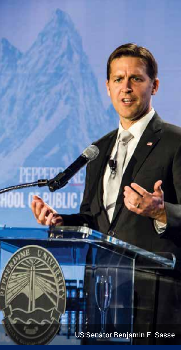
US Senator Benjamin E. Sasse